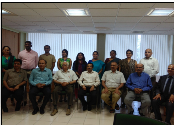
Board members with fellow students and staff of the Academy