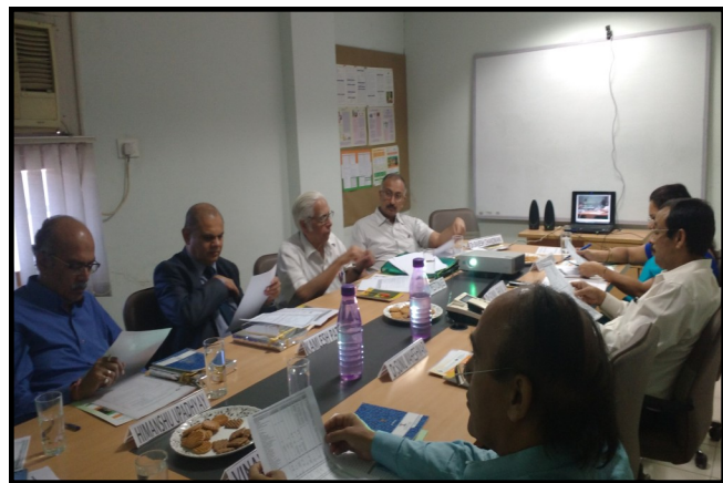
Board meeting at Academy of HRD on 22 April, 2017